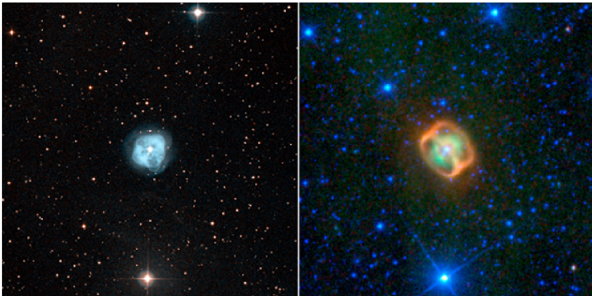
1514 (left) visible light, (right) infrared

*The purpose of the LVAS Observer's Challenge is to encourage the pursuit of visual observing. It is open to everyone who is interested. If you'd like to contribute notes, drawings, or photographs, the LVAS will be happy to include them in our monthly summary. Submit your observing notes, sketches, and/or images to either Roger Ivester ( rogerivester@me.com ) or Fred Rayworth ( queex@embarqmail.com ). To find out more about the LVAS Observer's Challenge or access past reports, log on to lvastronomy.com/index.php/observer-s-challenge .