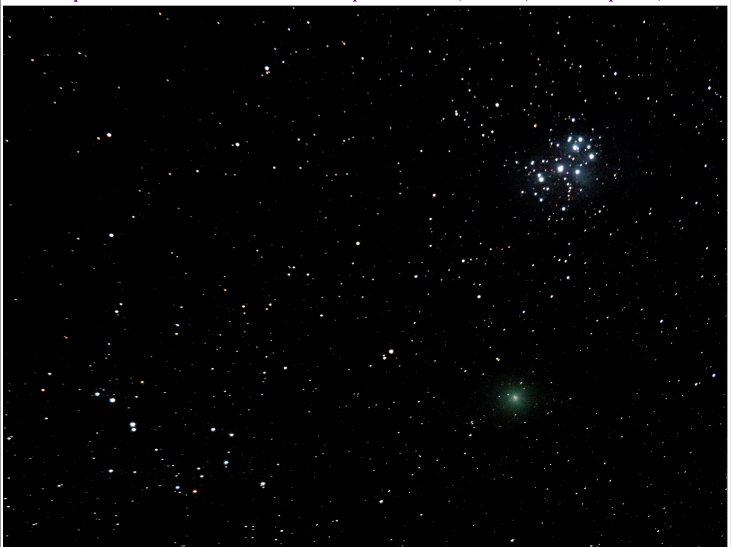
Specs: FL 153mm, ISO 1600, 3 x 1 min exposures, 12-15-18

This image of the comet was taken on the 15th, the day before closest approach where it positioned itself close to the Pleiades. The minimum distance between the comet and us occurred on the 16th (7,199,427 miles or 30 Moon distances). Ranked in terms of distance from Earth, it was the 20th closest approach of a comet dating as far back as the ninth century A.D., and the tenth closest approach since 1950. It was discovered about seventy years ago. On January 10, the comet reaches a maximum northern declination of +59 degrees. The comet is receding from us now so it will appear fainter each and every day.