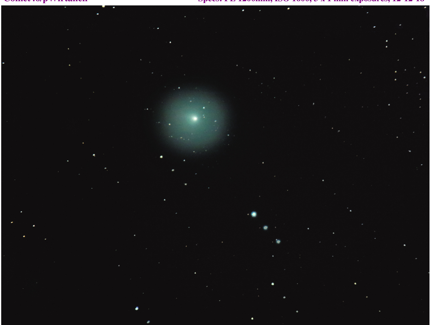
Specs: FL 1200mm, ISO 1600, 3 x 1 min exposures, 12-12-18

This close-up image was taken on the same night as the previous picture. I was hoping to capture its tail, but, later found out the ion tail will be behind the comet near closest approach. A tail may be seen in the coming days and weeks when its orientation will be different. The nucleus of the comet is approximately .75 miles in diameter (rather small). Its very bright because of its closeness to Earth. In contrast, the coma is rather dim, diffuse, and ghostly looking, which made it rather difficult to see in light polluted skies. In an absolute sense, the coma is bigger than the planet Jupiter.