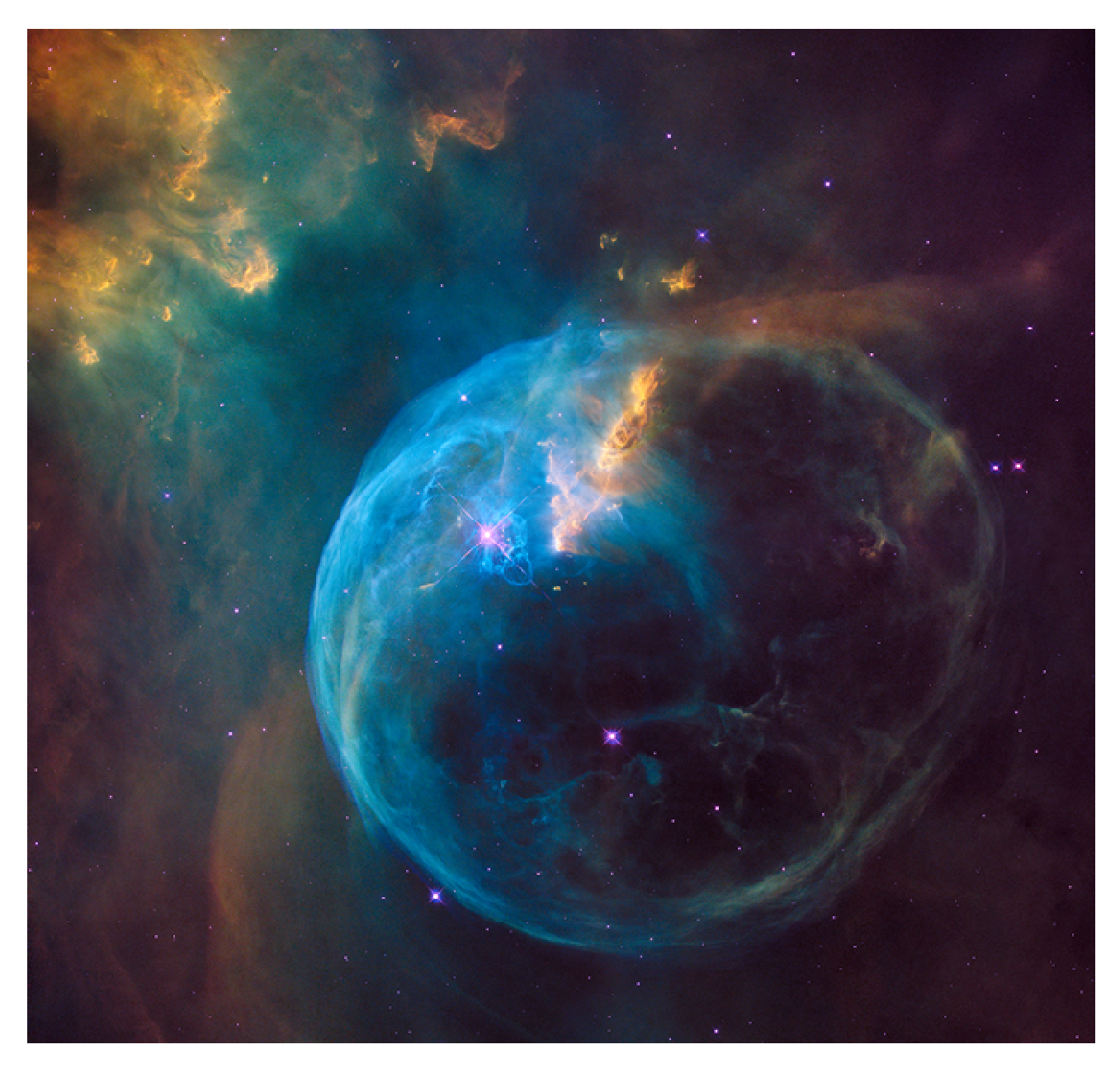
of the Bubble Nebula as imaged 229 years after its discovery by William Herschel.