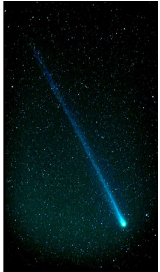
Comet Hyakutake: I took this photo on March 26, 1996. Using 200 speed slide film, a 50mm lens, and an exposure time of 4 min.

✓ How does the brightness of the comet compare to nearby deep-sky objects? This is a way to see whether the brightness has changed.